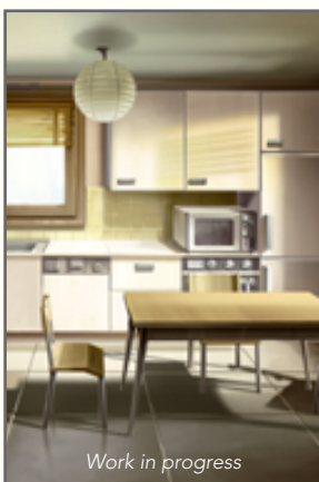
Kitchen 2D world